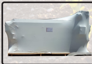
Shrink wrapped for shipping (additional cost)