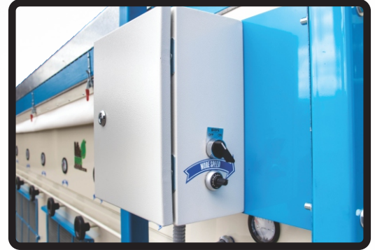
Variable frequency drive Panel