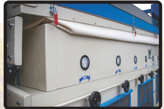
Individual Gauges & Controls