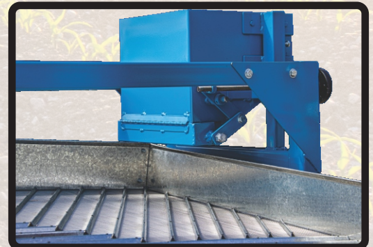
Adjustable flow Feeder