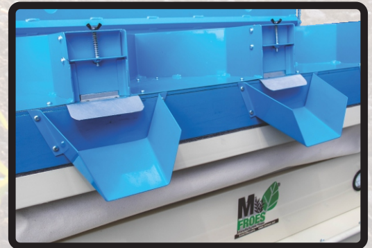
Spring loaded discharge gates