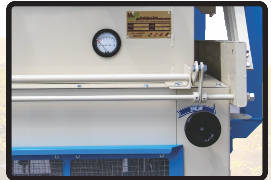
Air gauge & Air flow adjustment wheel