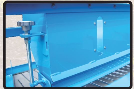
Adjustable flow Feeder with window