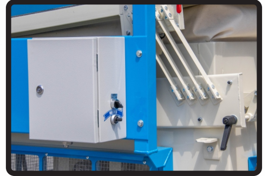
Variable frequency drive Panel